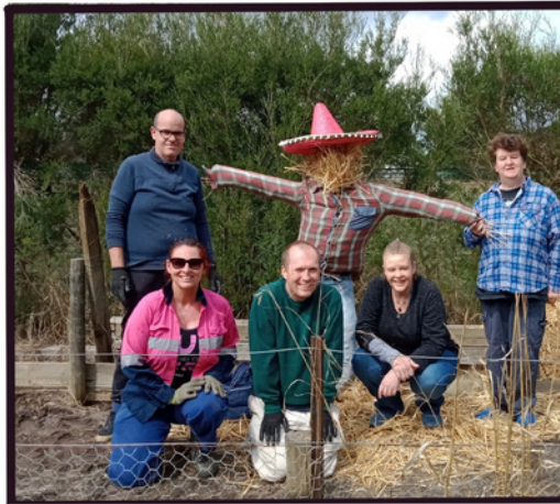
First gardening project (scarecrow)