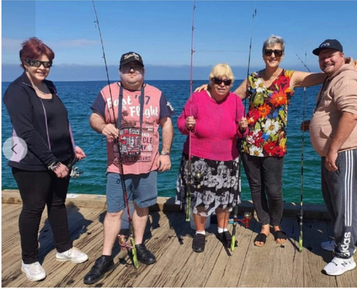
Fishing in Frankston