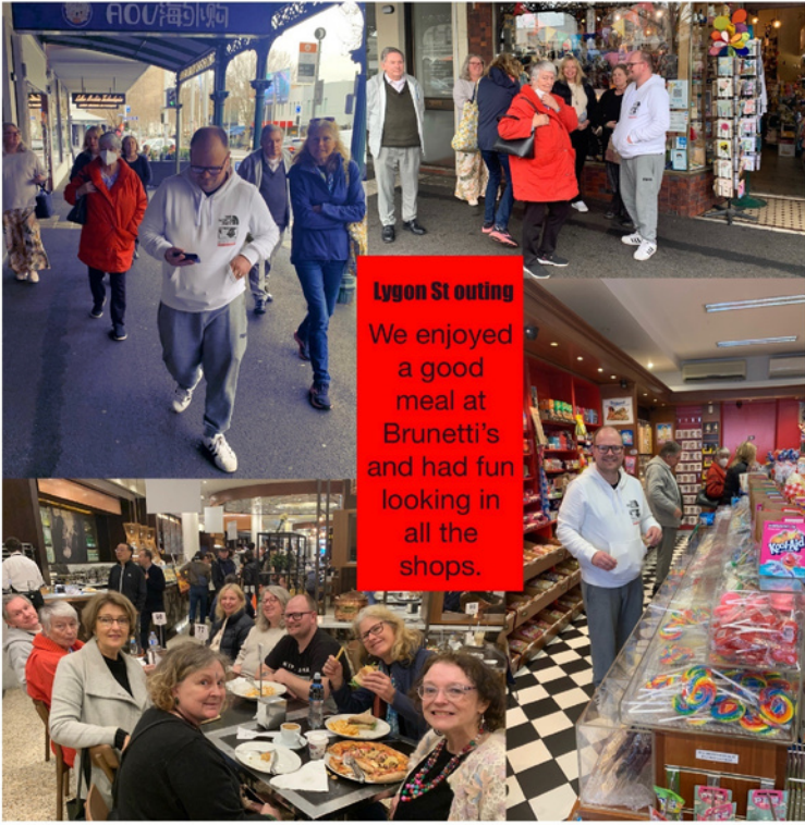
Lygon St outing We enjoyed a good meal at Brunetti's and had fun looking in all the shops.