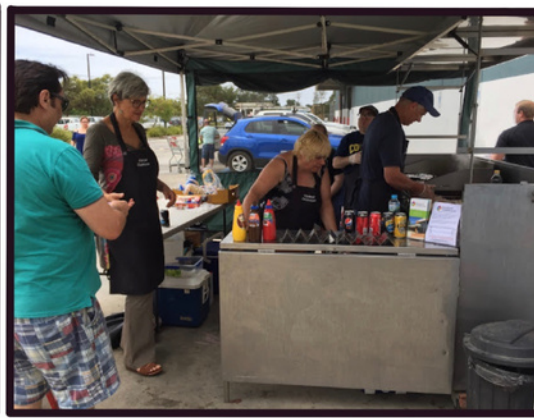
First Hastings Bunnings bbq