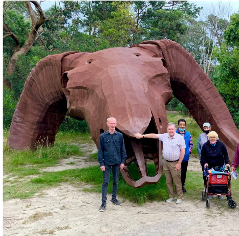
McClelland Sculpture Park