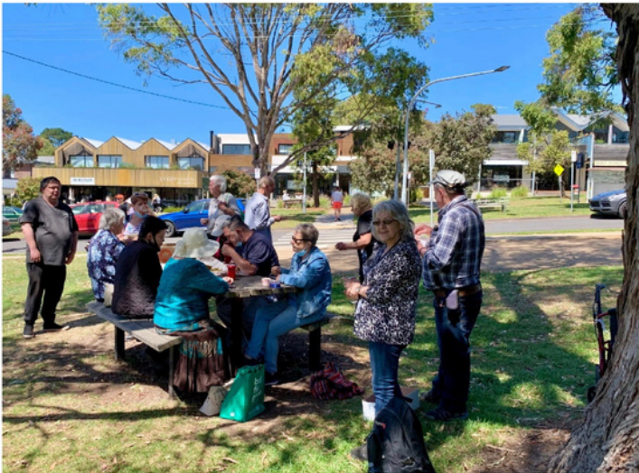
Fish and chips in Flinders